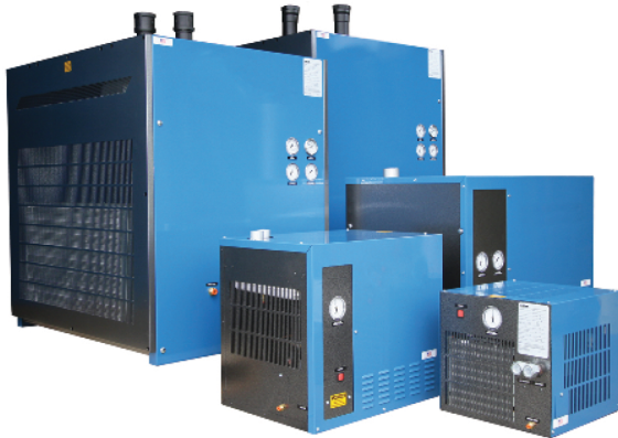
APET-10 to APET-1200

The Aircel APET Series (45 - 1,000 scfm) offers the highest efficiencies at high pressure conditions in a lightweight, compact design. APET Series dryers feature high pressure stainless steel, brazed plate heat exchangers, as well as all stainless steel air-side components. The design pressure of 725 psig (50 bar) is suitable for applications such as PET container production, injection molding, and component testing, as well as various naval and military functions.