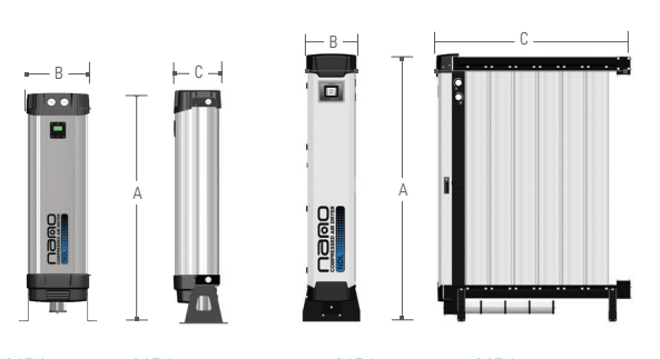
NDL 010 to NDL 130