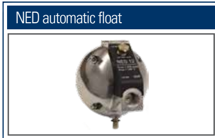
NED automatic float