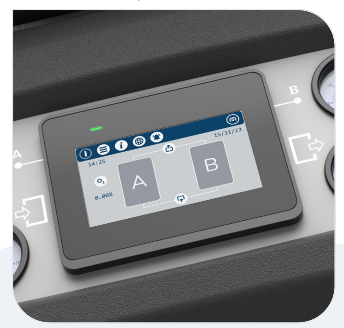
Operated by a reliable PLC or advanced HMI interface. (optional HMI controller shown)