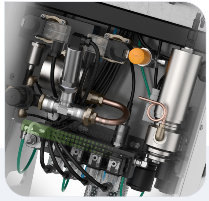
Robust piston valves significantly reduce maintenance schedules and minimise downtime.