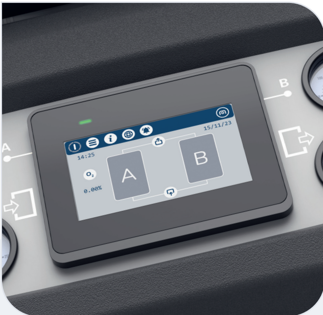
Operated by a reliable PLC or advanced HMI interface. (optional HMI controller shown)