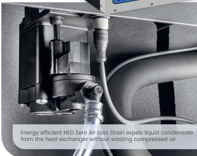
Energy efficient NED Zero Air Loss Drain expels liquid condensate from the heat exchanger without wasting compressed air.

Fully packaged into a simple compact design, TMC will fit into the smallest spaces.