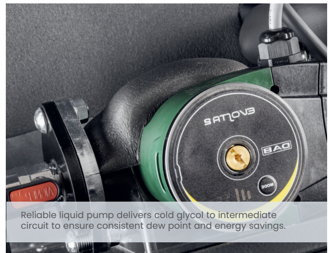
Reliable liquid pump delivers cold glycol to intermediate circuit to ensure consistent dew point and energy savings.