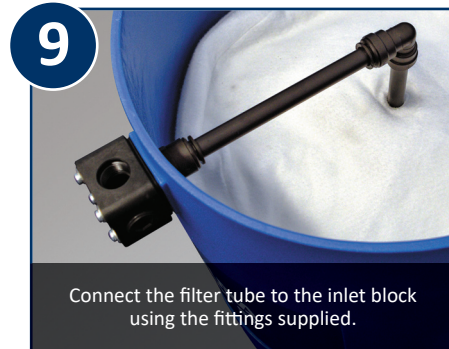
9 Connect the filter tube to the inlet block using the fittings supplied.