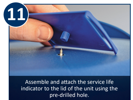
11 Assemble and attach the service life indicator to the lid of the unit using the pre-drilled hole.