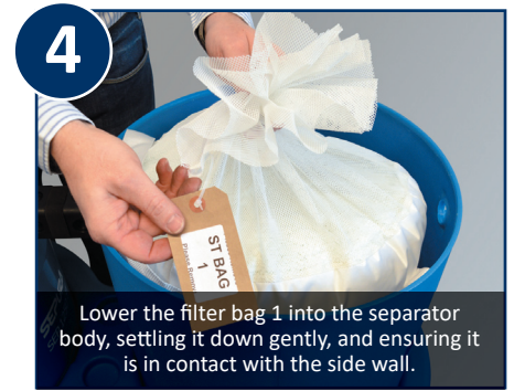
4 Lower the filter bag 1 into the separator body, settling it down gently, and ensuring it is in contact with the side wall.