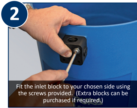
2 Fit the inlet block to your chosen side using the screws provided. (Extra blocks can be purchased if required.)