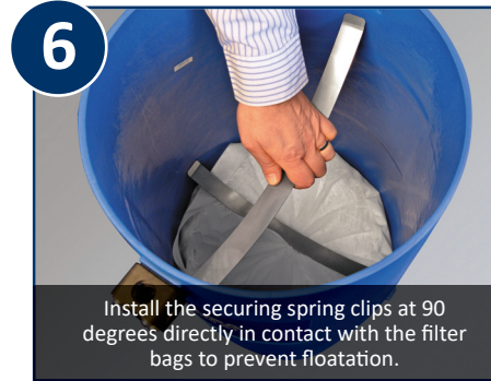
6 Install the securing spring clips at 90 degrees directly in contact with the filter bags to prevent floatation.