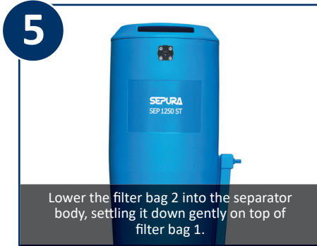
5 Lower the filter bag 2 into the separator body, settling it down gently on top of filter bag 1.