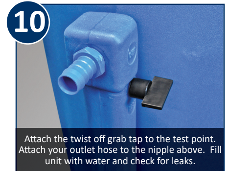
10 Attach the twist off grab tap to the test point. Attach your outlet hose to the nipple above. Fill unit with water and check for leaks.