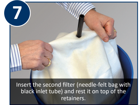
7 Insert the second filter (needle-felt bag with black inlet tube) and rest it on top of the retainers.