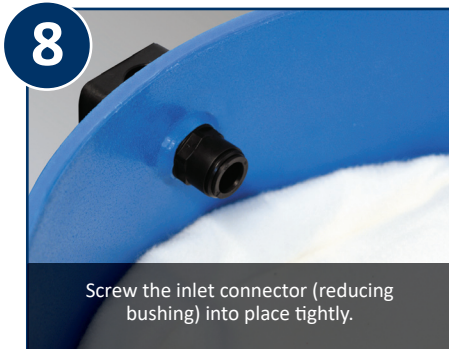
8 Screw the inlet connector (reducing bushing) into place tightly.