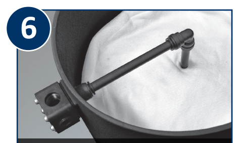
Connect the filter tube to the inlet block using the fittings supplied.