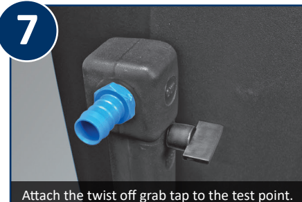
Attach the twist off grab tap to the test point. Attach your outlet hose to the nipple above. Fill unit with water and check for leaks.

Install the securing spring clips at 90 degrees directly in contact with the filter bags to prevent flotation.