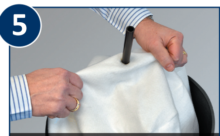
Insert the third filter bag (needle-felt bag with black inlet tube) and rest it on top of the retainers.

Lower the filter bag 1 into the separator body, settling it down gently, and ensuring it is in contact with the side wall.