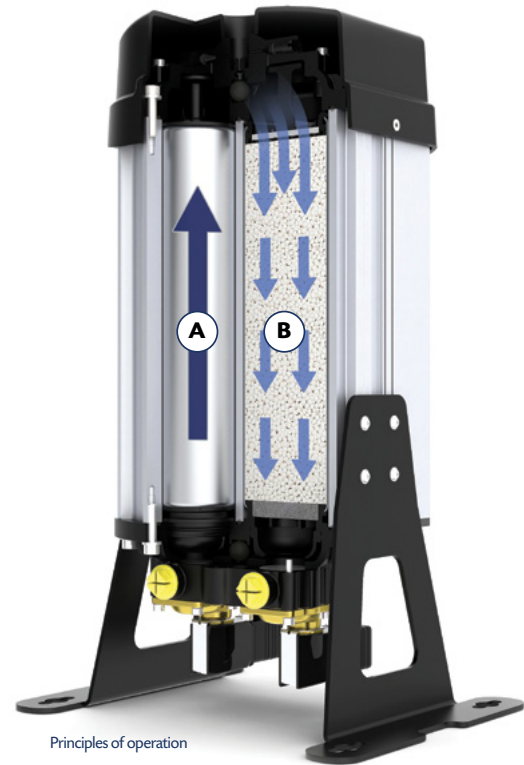
Principles of operation

Heatless desiccant dryers are the most common due to their simplicity and hence low cost. A heatless twin tower dryer (see figure opposite) operates by removing moisture through adsorption onto a granular desiccant bed from the feed air (typically at 100 psig) as it flows up through a packed bed of desiccant, column A. Column B (having been previously used in drying the inlet air) is at atmospheric pressure and dry purge air from the outlet of column A is fed through a purge valve, expanded to near atmospheric pressure, and flowed in contra flow direction down through column B to effect the regeneration of its granular desiccant bed. When the desiccant in column A becomes saturated with water vapor (usually determined by a simple timer controller) the feed air is switched back to column B, after it has been pressurised, and the cycle continues.