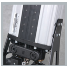
Atmospheric exhaust silencer