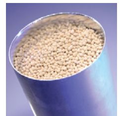
Unique patented nano desiccant cartridge.

Desiccant air dryers are used for high purity applications where pressure dewpoints of -70,-40 and -20°C are required according to ISO8573.1 humidity classes 1, 2 and 3 respectively.