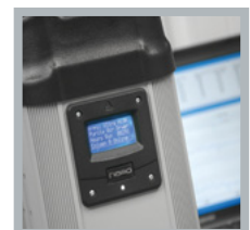
PLC controller with clear text display.