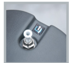
Quick release outlet connector

Purge air loss or reduction is another common problem which results in incomplete regeneration and loss of dew point leading to serious failure if left unchecked. Such problems are caused by purge air control valves becoming blocked or back pressure built up in the exhaust air silencers with desiccant dust. Both conditions lead to reduced volumetric purge air flow which result in incomplete regeneration.