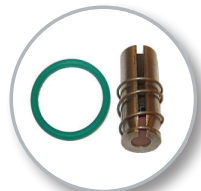
NHPTD 600 & 1200 maintenance kit