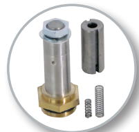
NETD & NPTD maintenance kit