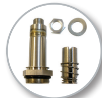
NHPTD 3625 & 5000 maintenance kit