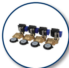
valves & solenoid coils