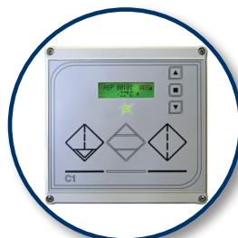
controller parts available